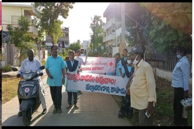
Rally near SVL College